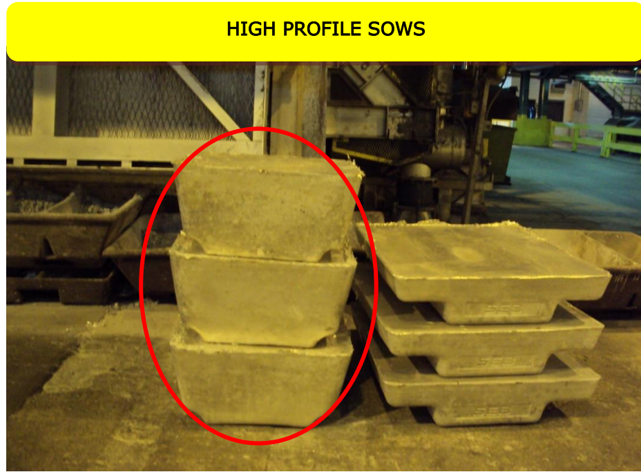
High profile sows will be instantly rejected.

All ingots must be skimmed. Un-skimmed or poorly skimmed ingots are unacceptable. A photo of a well-skimmed ingot is shown below. The second figure shows a poorly skimmed ingot. The third figure shows a sow with fins, which is caused by poor manual skimming.