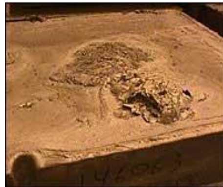
Dross skim cast into ingot