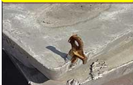
Steel Pin left in corner of sow