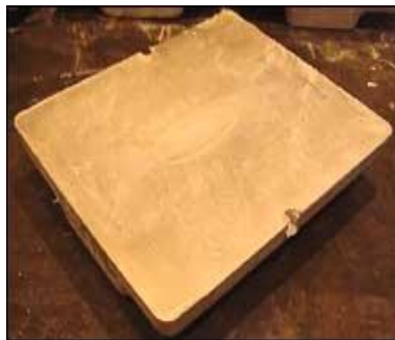
Ideally skimmed sow

All ingots must be skimmed. Un-skimmed or poorly skimmed ingots are unacceptable. A photo of a well-skimmed ingot is shown below. The second figure shows a poorly skimmed ingot. The third figure shows a sow with fins, which is caused by poor manual skimming.